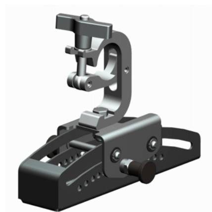
XD12 Universal bracket (Trigger clamp not included)