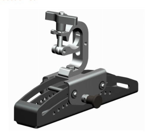
XDI5 Universal bracket (Trigger clamp not included)